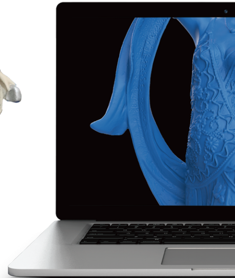
Handheld HD Scan Mode